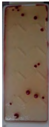
After 1.5 months with 50% less biocide (between 1,000 to 5,000 CFU)

Biocide chemicals kept CFU levels at a minimum