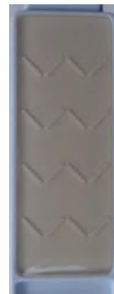
After 3 months with 75% less biocide (under 1,000 CFU)

Slight raise in CFU count as HydroFLOW began to remove biofilm from the cooling tower