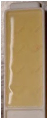
Baseline measurement with 100% biocide (under 1,000 CFU)

Total bacteria count in the tower's recirculating water: